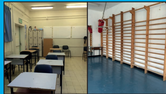
Classroom and gym before