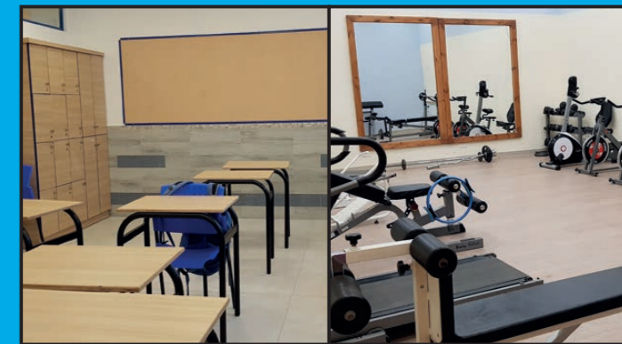
Classroom and gym after

Through the decades legacies to WIZO have enabled ongoing investment in our vital work ensuring adequate facilities, teaching and social welfare programmes and life-changing technology, to meet the evolving needs of vulnerable and disadvantaged Israeli citizens in our care.