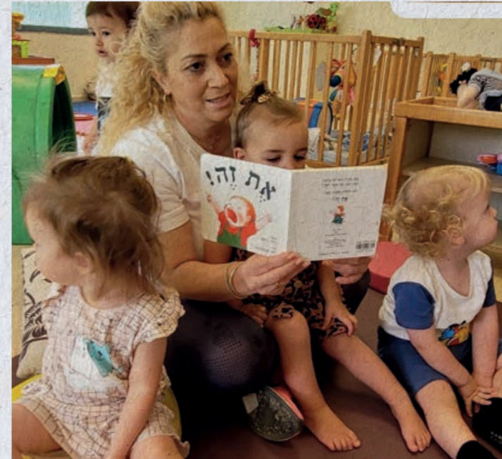
Books from the Pyjama Library being read in a WIZO Day Care Centre

of reading together. Reading and owning books is something that many of us take for granted, but for many low-income families and immigrants, who benefit from this programme, the books they are given each month are the only books that they have at home.