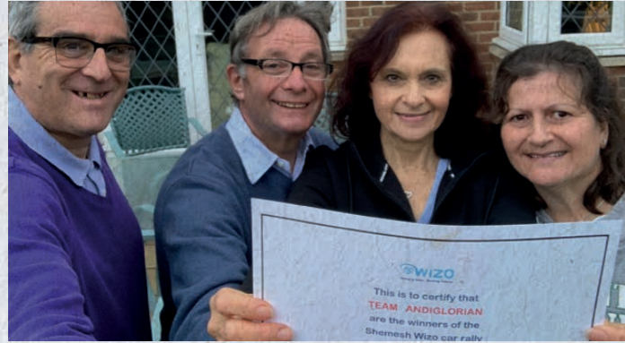
Winners of the Shemesh Aviv Car Rally

youth and improving the welfare of disadvantaged citizens from all sectors of society. Although Israel is globally regarded as a high-tech nation, "if you scratch below the surface... many Israelis live in poverty and the education gap between populations is growing – only deepened by the pandemic. Now more than ever, vulnerable populations are reliant on WIZO's assistance."