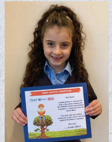
Winners of our Young Writers' Competition