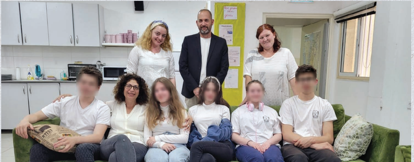
Ukrainian refugees students and their families

Just when we all thought the world was returning to some normality, February 2022 saw the invasion of Ukraine. WIZOuk ensured it played its part with its London pop-up shop successfully raising significant funds to support arriving Ukrainian refugees at WIZO schools in Israel. WIZO schools have now over 190 Ukrainian and Russian students all receiving an education, counselling, care, clothes and school equipment.